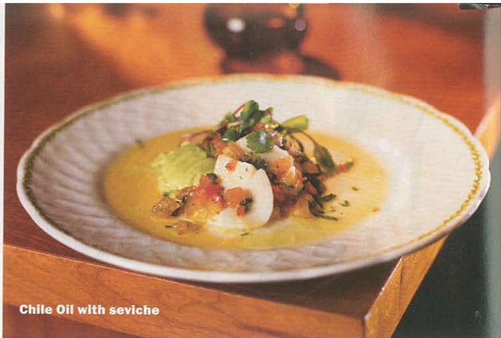
Chile Oil with seviche

Another variation is to use just oil. A fine-quality, extra-virgin olive oil can, on its own, enhance a simple vegetable salad. When distinctive oils, such as nut oils,